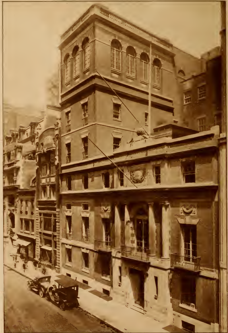
THE HARVARD CLUB, situated near the New York Yacht Club, on 44th Street, frequented by graduates of the great university whose name it bears.